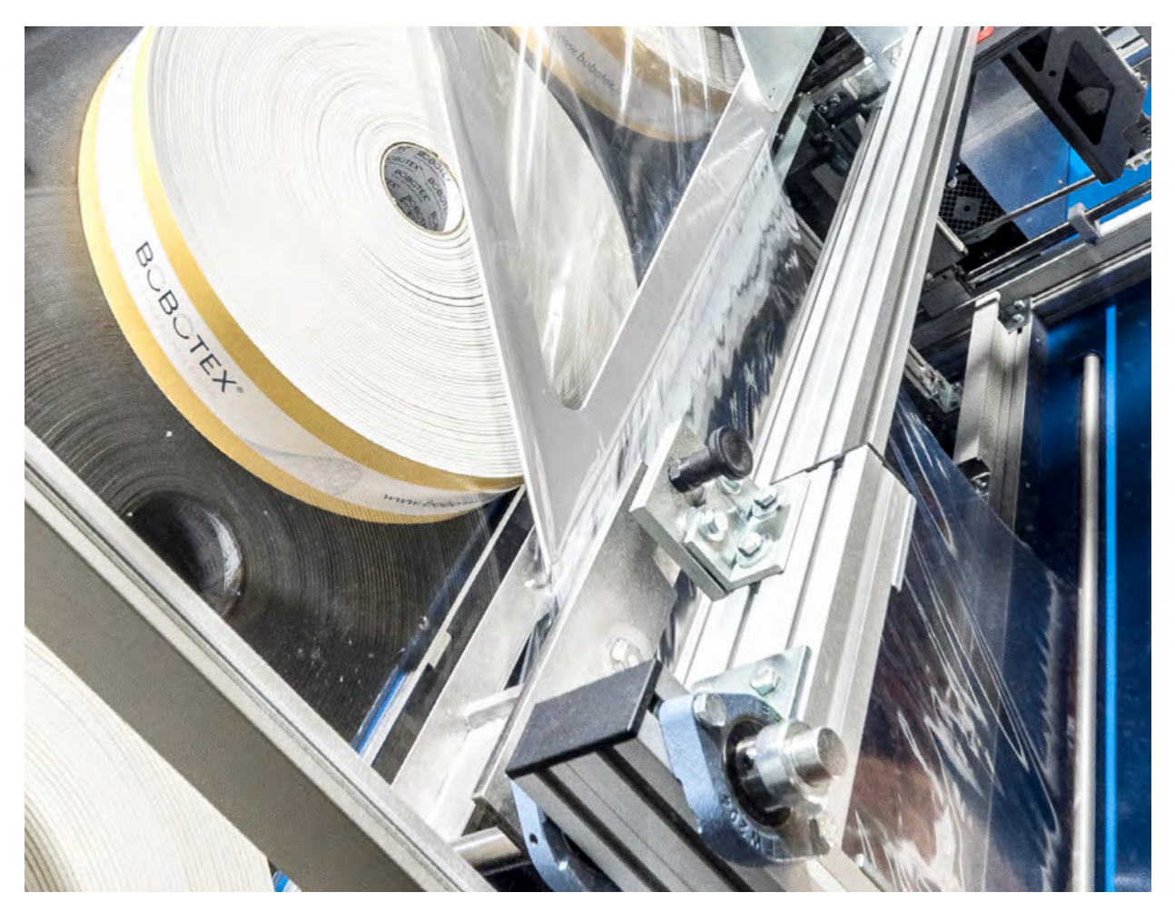
The Foil Wrap machine Compacta EGS has been employed at BOBOTEX® production centre since the beginning of March 2017.

BY INVESTING SIMULTANEOUSLY IN TWO DIFFERENT PRODUCTION MACHINES, BOBOTEX® REALIZES ITS PLANNED PORTFOLIO ENLARGEMENT. FOR THE SPECIALIST IN ROLLER COVERINGS PRODUCTION FROM WUPPERTAL THIS IS MORE THAN A SIMPLE EXPANSION.