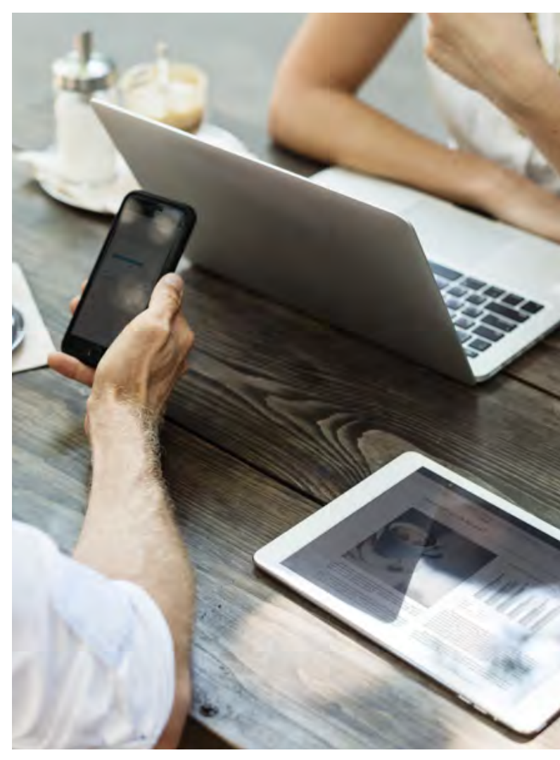
To our experts, it is undisputed that the IoT will revolutionise our type of economic activity, as well as our day-to-day lives.

the digital strategy of small and medium-sized businesses. It is all the better to invest in the fourth industrial revolution than to be dependent on its breakneck pace. However, there are already tendencies that encourage us: digital technologies will quickly become financially affordable for a large group of companies. We are experiencing quantum leaps in robotics, data analysis, cloud computing, artificial intelligence, materials and new production methods, such as 3D printing, on an almost daily basis. The speed is breathtaking and the tendency is on the rise.